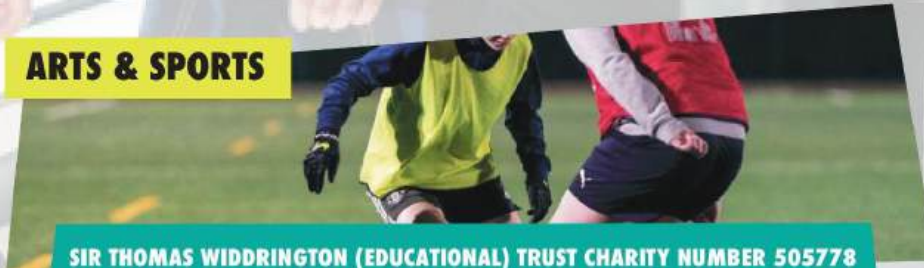
ARTS & SPORTS

SIR THOMAS WIDDRINGTON (EDUCATIONAL) TRUST CHARITY NUMBER 505778