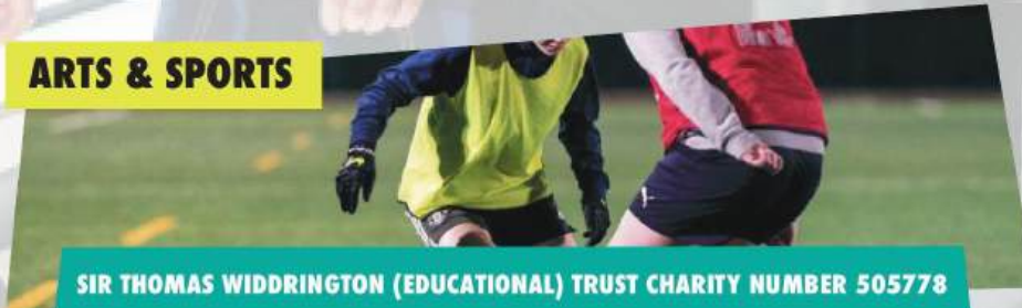
ARTS & SPORTS

SIR THOMAS WIDDRINGTON (EDUCATIONAL) TRUST CHARITY NUMBER 505778