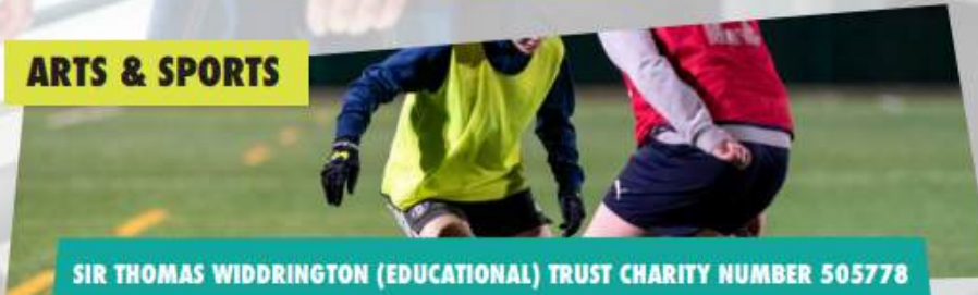
ARTS & SPORTS

SIR THOMAS WIDDRINGTON (EDUCATIONAL) TRUST CHARITY NUMBER 505778