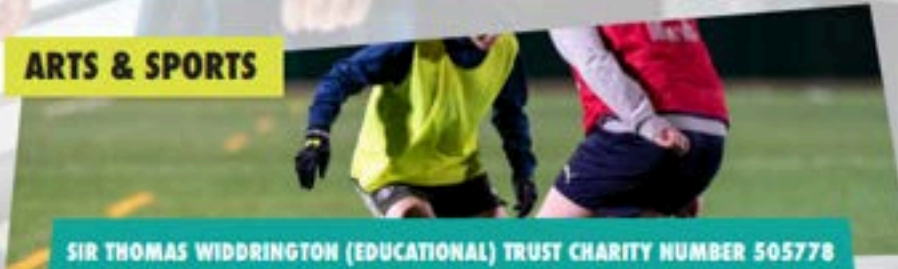
ARTS & SPORTS

SIR THOMAS WIDDRINGTON (EDUCATIONAL) TRUST CHARITY NUMBER 505778